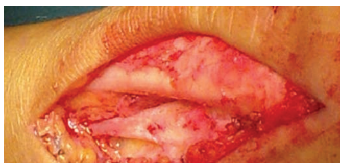
Figure 2 Thickened and widened plantaris tendon found ventral (deep side) to the medial side of the Achilles mid- and distal portion. Notice fat tissue interpositioned between the Achilles and plantaris tendons.